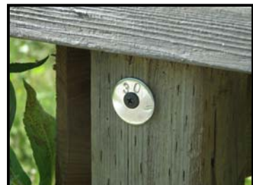
Stiles being numbered